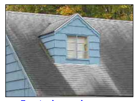
Extensive algae growth.